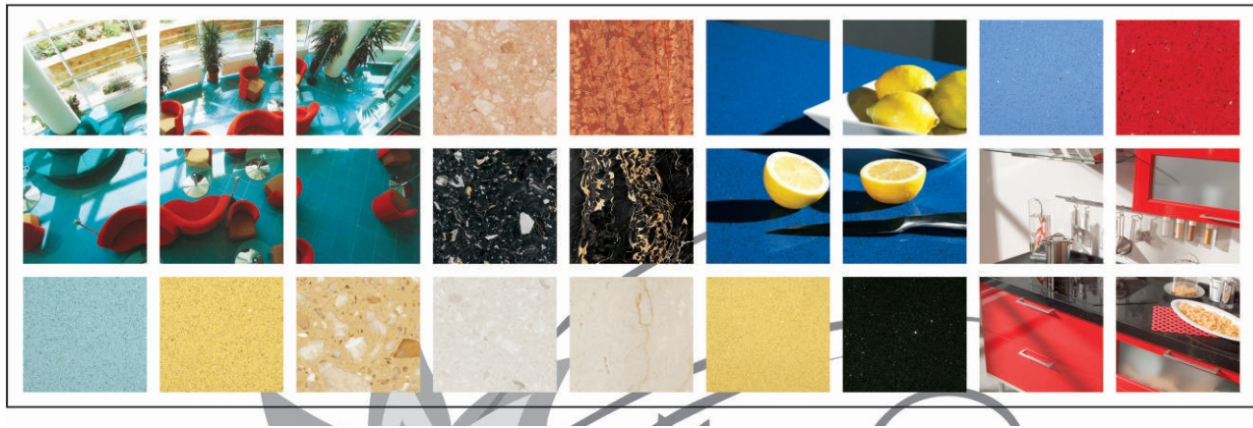
Processors of Premium Quality (Natural & Engineered) Imported Marble