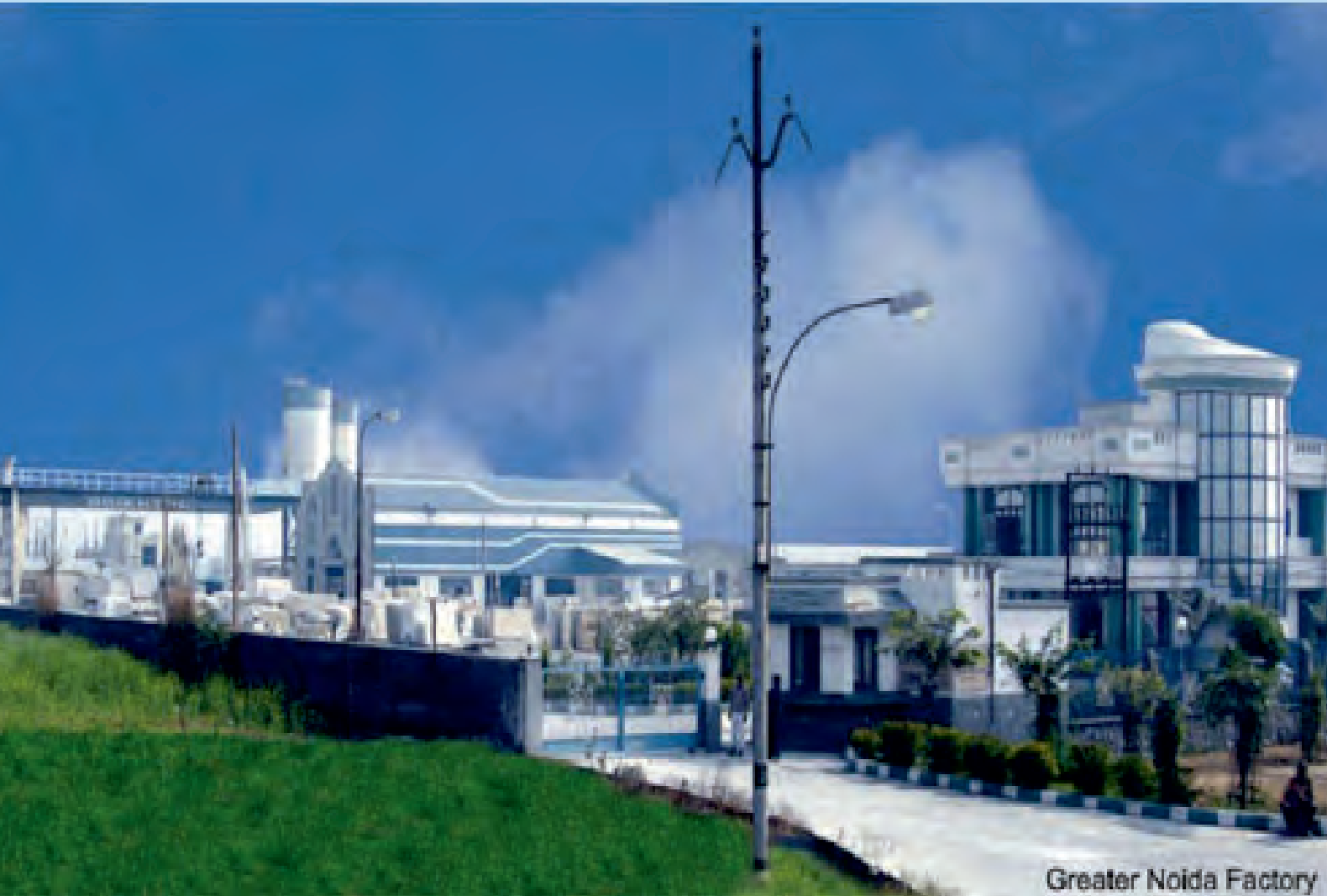
Greater Noida Factory